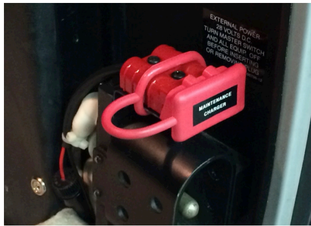
Maintenance charger plug & cover installed.