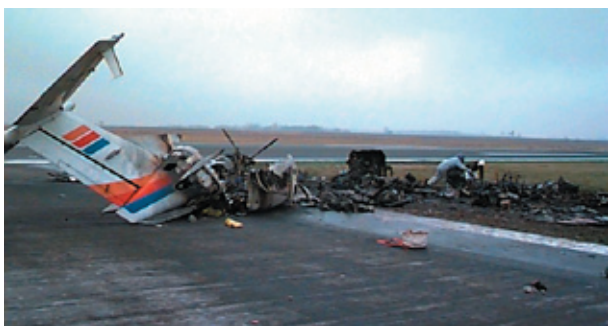
Remains of the Beech 1900C after the collision and ensuing fire.

The NTSB determined that the probable cause of the accident was the failure of the pilots of the King Air “to effectively monitor the CTAF or to properly scan for traffic...”